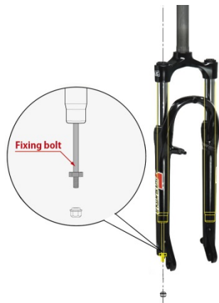
Figure: Singular fixing bolt version (Right Side Only)

SR SUNTOUR North America, Inc. Announces Recall of M3010 (24" and 26"), M3020 (24" and 26"), M3030 (26", 27.5" and 29"), NEX (700 c), and XCT (20", 26", 27.5" and 29") Bicycle Forks